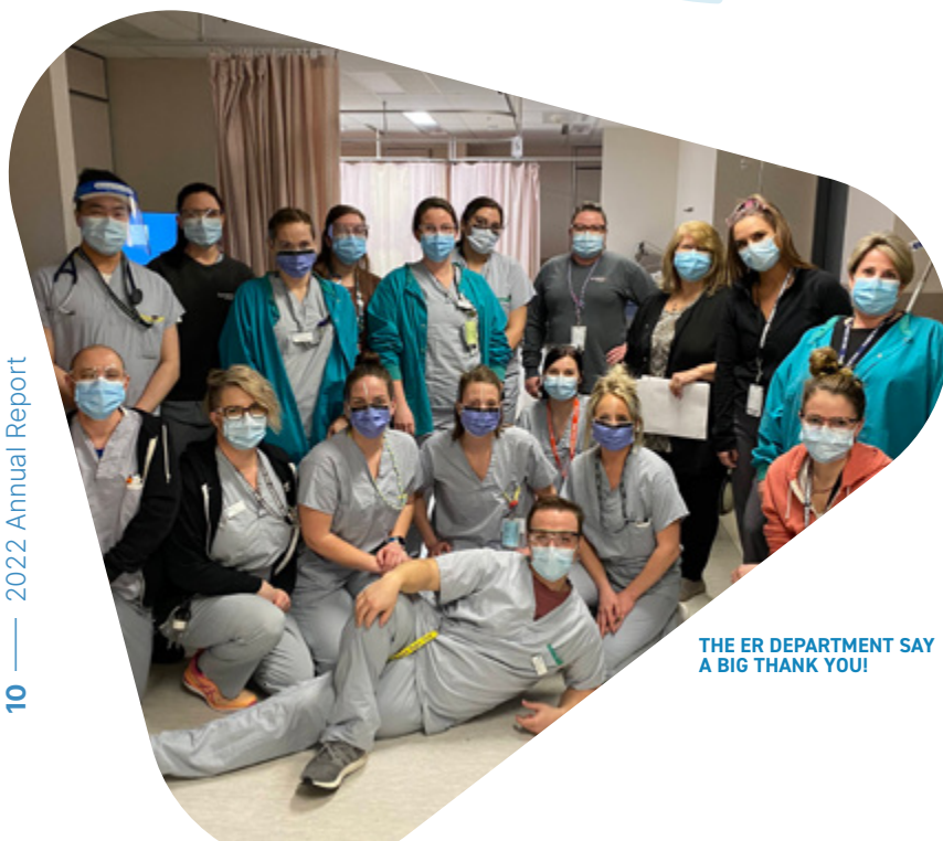
THE ER DEPARTMENT SAY A BIG THANK YOU!

“A BIG “THANK YOU” TO THE COMMUNITY FROM ALL OF US HERE IN THE STAFFING OFFICE FOR STAFF APPRECIATION TODAY. IT WAS GREATLY APPRECIATED, AND THE FOOD AS WELL WAS GREAT!”